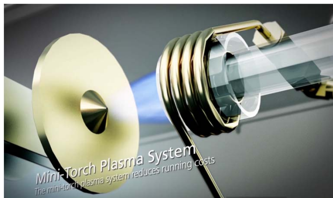
Fig 2. Quartz mini torch for ICPMS-2030

The calibration standard solutions showed good linear response with correlation coefficient ( r \geq 0.999 ) for all elements. Results of percentage recoveries for Apple and Pear are given in Table 5.