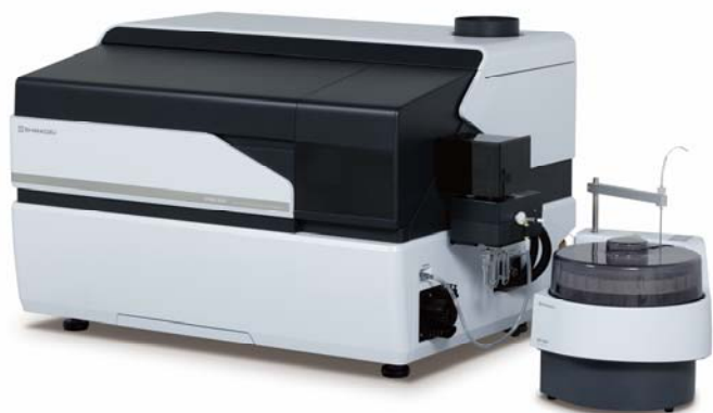
Fig 1. Shimadzu ICPMS-2030 with autosampler AS-10 Continuous Calibration Verification (CCV) checks were run in between to monitor drift of the system throughout the run. Standard of LOQ concentration was run as CCV.

A Shimadzu ICPMS-2030 coupled with auto sampler AS-10 and quartz mini-torch plasma system (Figure 1 & 2) was used for developing method for measuring elements in Apple and Pear. The instrument configuration and operating parameters are summarized in Table 4.