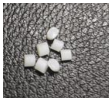
Fig.1 Polymer Beads Used in Analysis

The temperature settings that were used for pyrolysis (Py)-GC/MS and thermal desorption (TD)-GC/MS are 550°C and 300°C (5 min), respectively, using the EGA (evolved gas analysis)-MS method. The polymer additive constituents were predicted from the measured chromatogram (TIC).